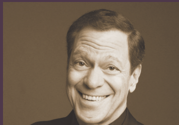
JOE PISCOPO HOST OF THE JOE PISCOPO SHOW AM 970 THE ANSWER

CHABAD OF HUNTERDON COUNTY CORDIALLY INVITES YOU TO OUR